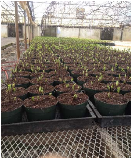
Finished Group of 4" 2+ cane plants Transplanted 2 per 6.5" Azalea pot. Achieving 4-6 canes per finished container.

Kurt Miller Dahlstrom & Watt Bulb Farms Inc kurt@dahlwatt.com www.dahlwatt.com