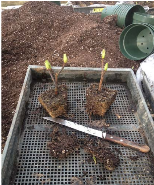
Step 4: 2 plants each with a corner cut off.