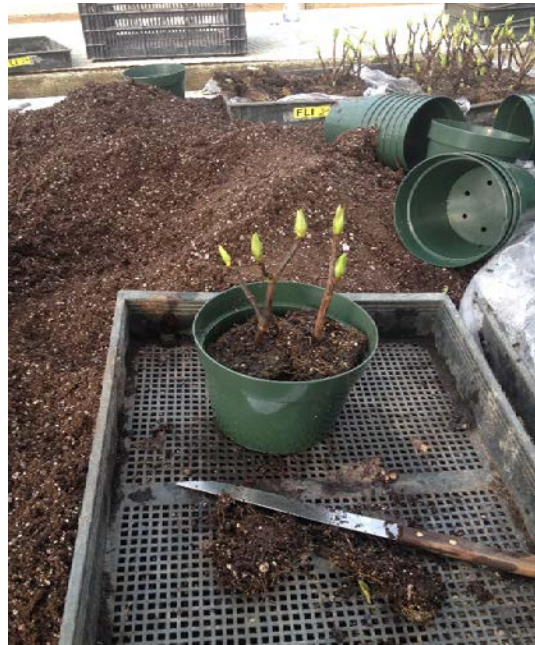
Step 5: place 2 plants into 6" or larger pot. (6.5" azalea pot pictured)